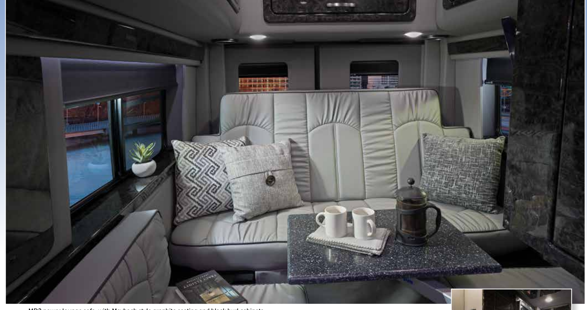
MD2 power lounge sofa, with Maybach style graphite seating and black burl cabinets.