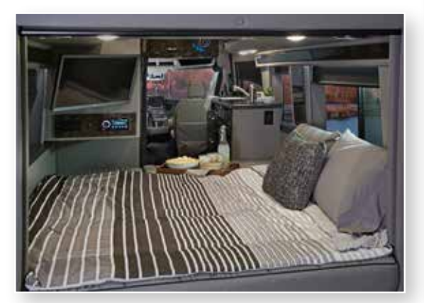
Power lounge in sleeping position

Luxury appointments and amenities abound in the Passage from Midwest Automotive Designs. Unmatched elegance and style, complimented by superior craftsmanship, fit and finish, make this luxury coach truly one of a kind.